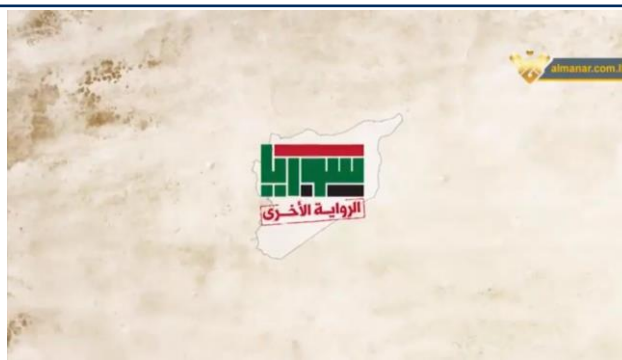
The logo of the program: “Syria – The Other Narrative”